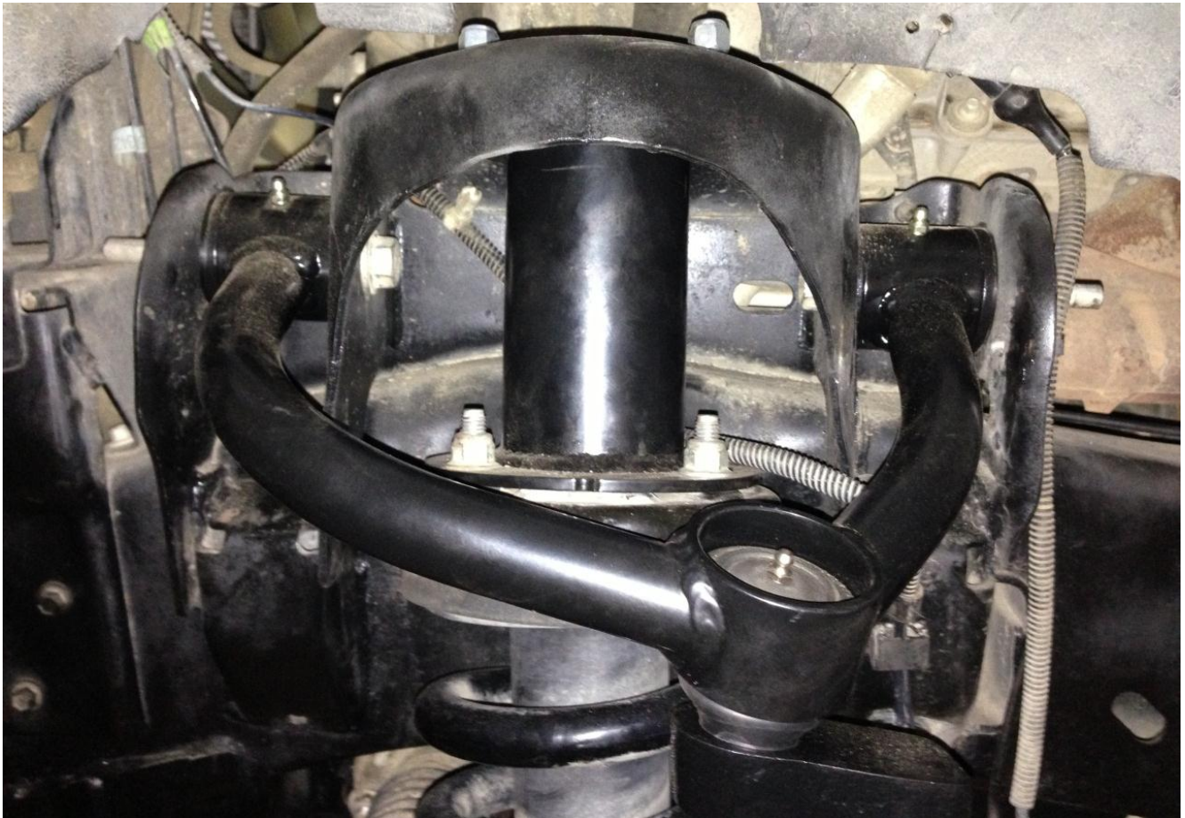
Driver Side Upper Control Arm Installed