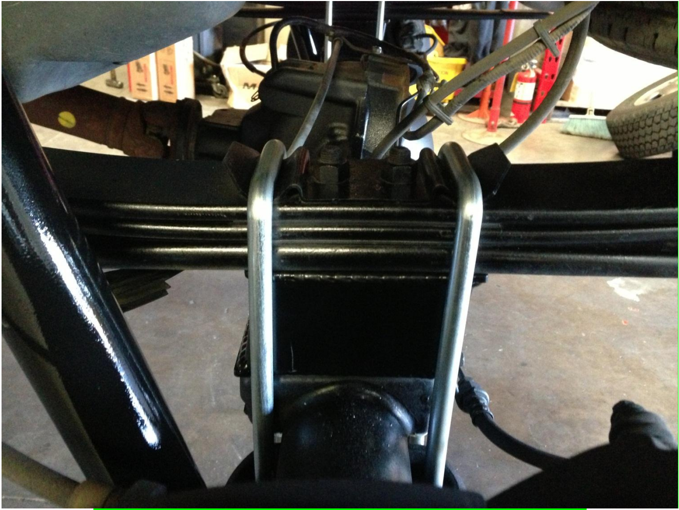
Install Rear Lift Block As Show In Picture Above