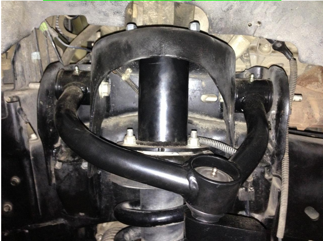
Driver Side Upper Control Arm Installed