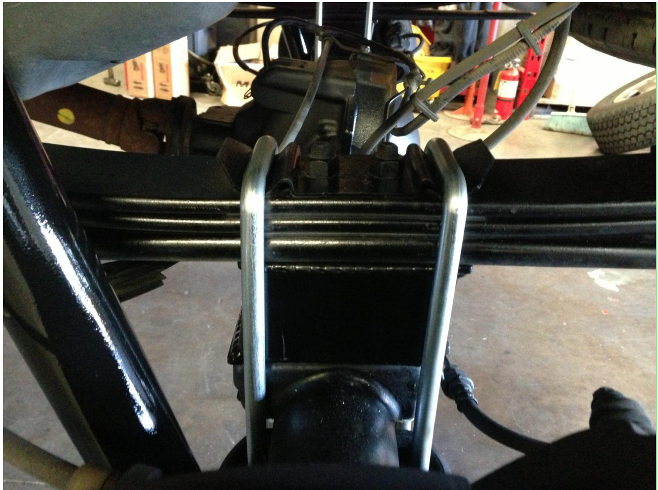
Install Rear Lift Block As Show In Picture Above