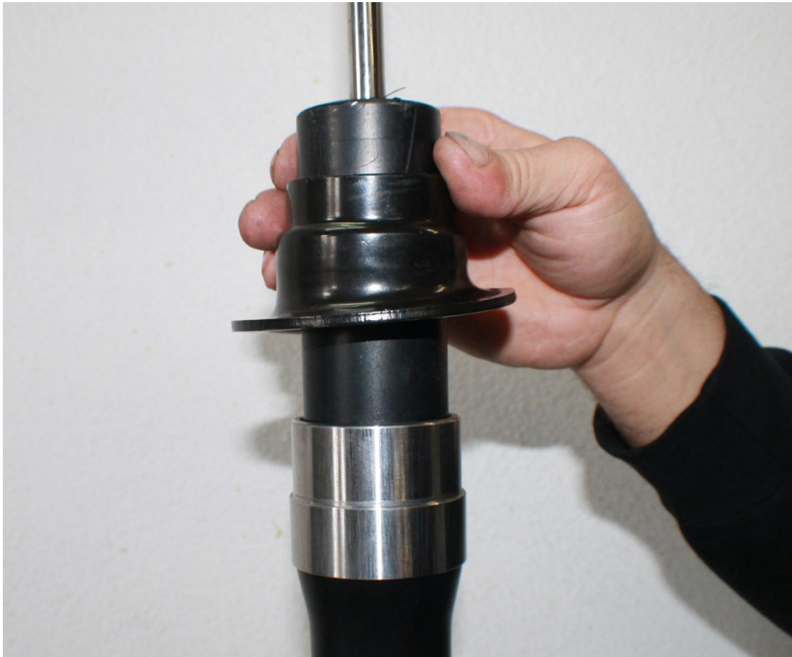
Installation Picture Of Spacer Installed