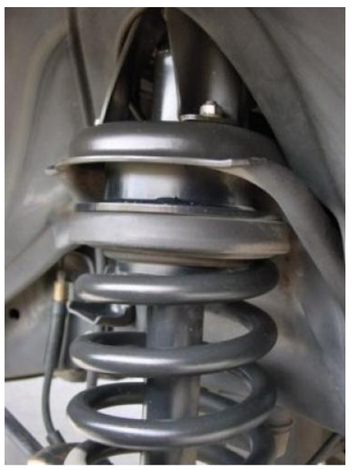
Product Warranty and Warnings-

FTS provides a Limited Lifetime Warranty to the original retail purchaser who owns the vehicle, on which the product was originally installed, for defects in workmanship and materials.