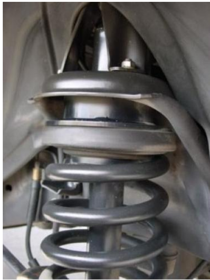
Product Warranty and Warnings-

FTS provides a Limited Lifetime Warranty to the original retail purchaser who owns the vehicle, on which the product was originally installed, for defects in workmanship and materials.